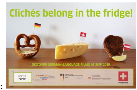
May 16 - June 9:

There are still a few more days left to watch some of the great selection of this year's Seattle Intereantional Film festival! There are several German Language movies still to come: For movie line up and tickets: <a href="https://www.siff.net/">https://www.siff.net/</a>